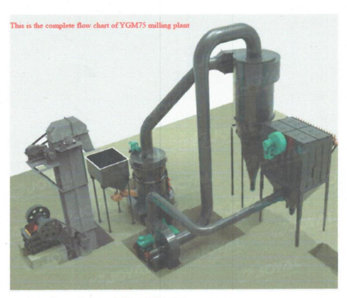
Figure 1. The complete flow chart of YGM75 Milling plant

Additional document for P.R. No. 23-07-235