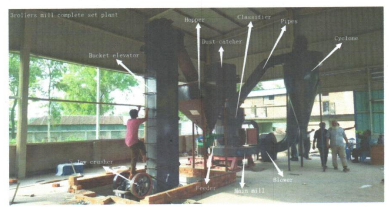
Figure 3. The YGM recommended workplace.