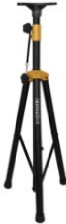
Item No. 7