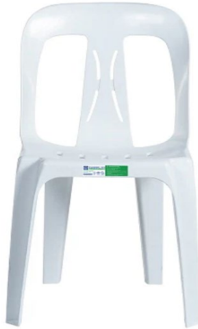
Item No. 9