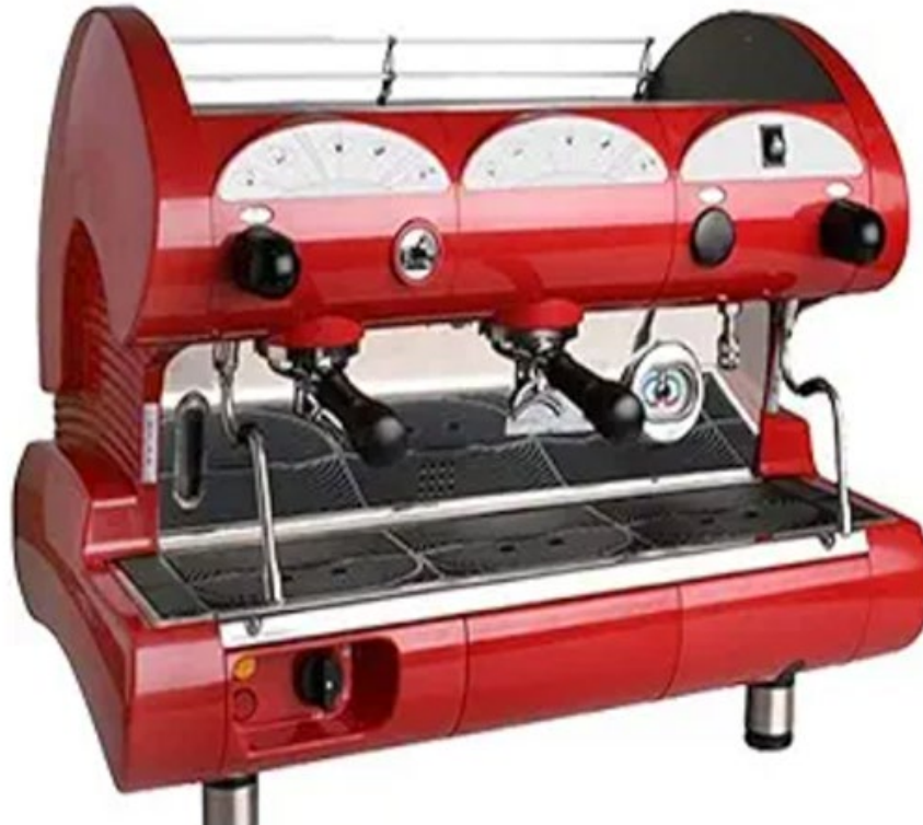
Item No. 2