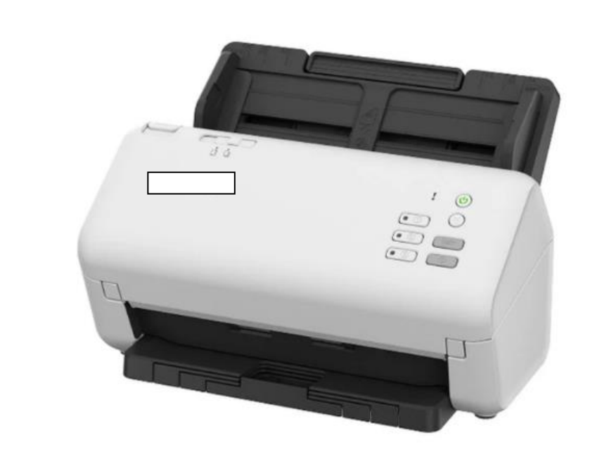
Item No. 28