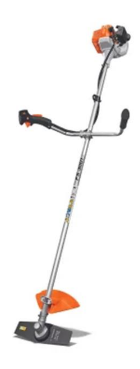
Item No. 8