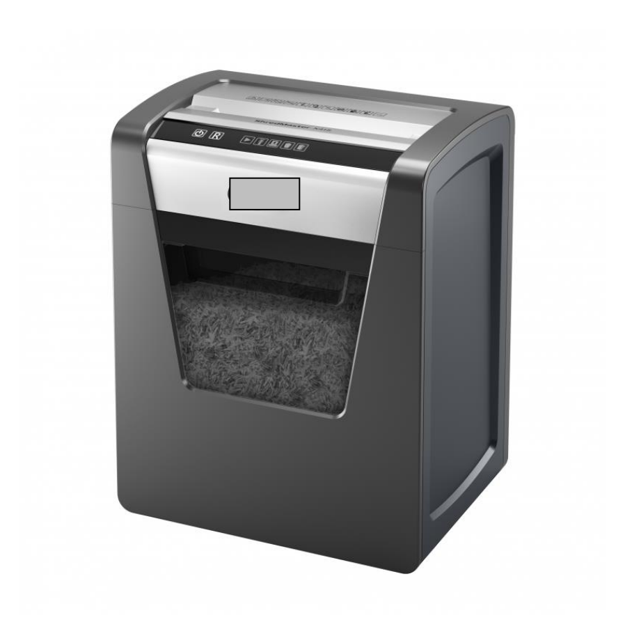
Item No. 30