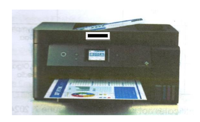
Item No. 6